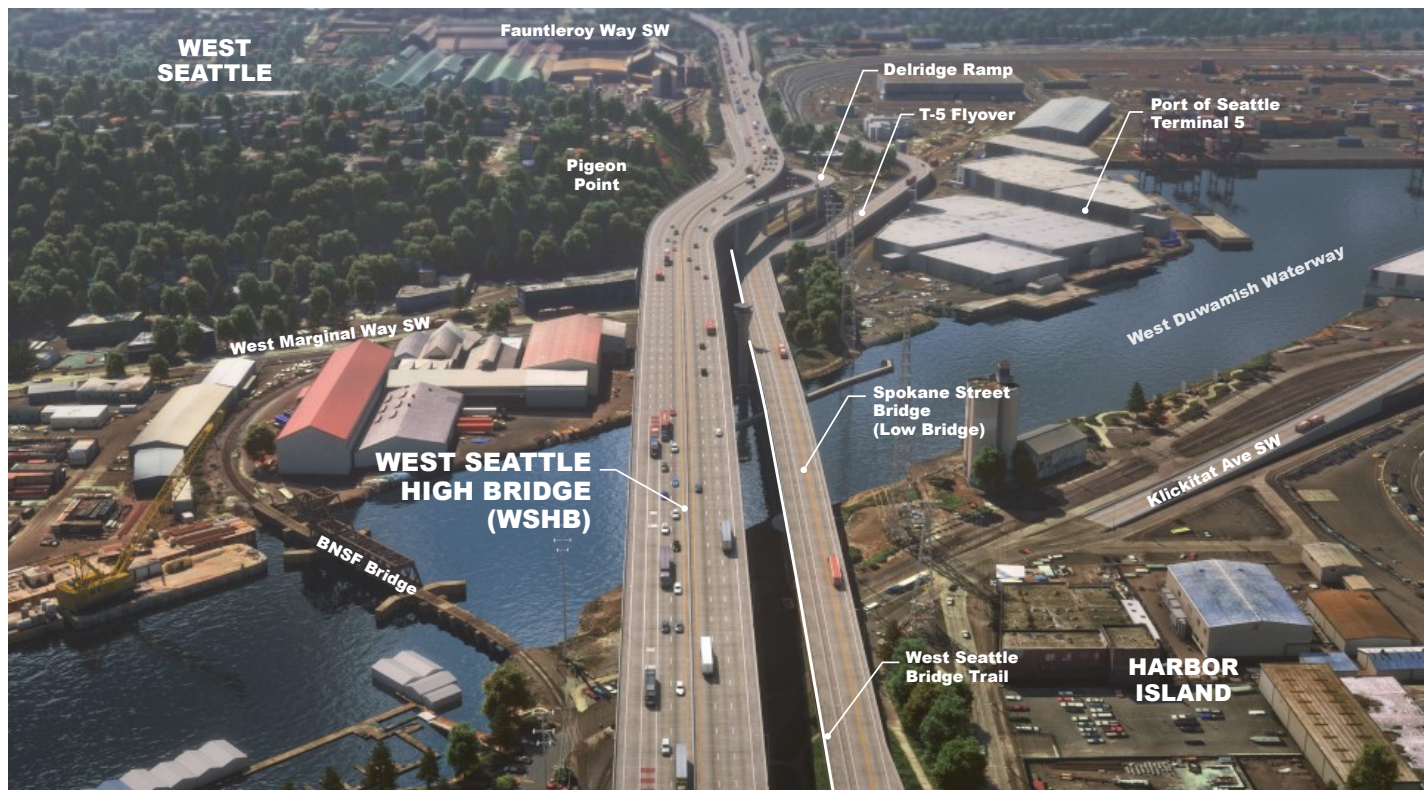
Figure ES-1. WSHB Context

The WSHB is a portion of the longer West Seattle Bridge, which is the primary east-west route for accessing West Seattle, the portion of the City located west of the Duwamish Waterway. The WSHB and surrounding facilities in the corridor are illustrated on Figure ES-1.